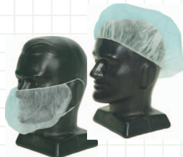
Beard Covers, Hair Nets See page 94