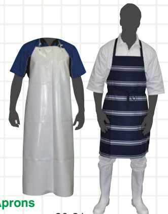
Aprons See pages 80-81