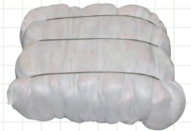
Bulk Bag 720 pairs

These reduced environmental impact polycotton knitted gloves are economical, highly absorbent and a good thermal insulator. Wear them alone, or under rubber or chain-mesh gloves for comfort or warmth. One size fits up to large.