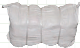
Bulk Bag 240 pairs