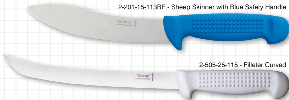
2-201-15-113BE - Sheep Skinner with Blue Safety Handle

CATALOGUE PAGE NUMBERS 10, 17, 18, 20, 21, 25, 30